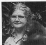
Champion: Dr. Biruté Galdikas