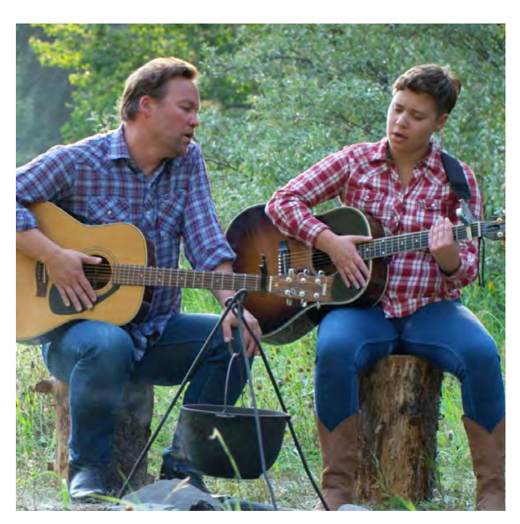
John Ware Reclaimed

Black people in Canada have been subjected to racial discrimination since they arrived at the early colonies. The historical, long-standing manifestation of systemic racism rooted in white supremacy that people of African descent in Canada have faced is called anti-Black racism.